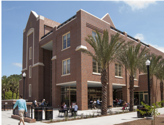
Students enjoy many academic resources at the Honors, Scholars, and Fellows House.