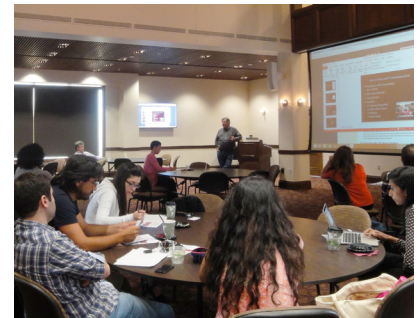
PIE Workshop: Online Teaching (Summer 2015)

The HSF building is located to the southeast of the Strozier Library, between Cawthon Hall and the William Johnston Building on Landis Green. To enter, follow the sidewalk that wraps around the the first floor. Enter the glass elevator bay. There is also a stairwell entrance on the second floor.