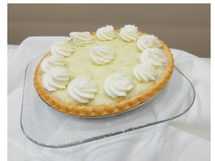
Students love the classic pies provided at the PIE Coffee Hour and Teaching Workshop Series!